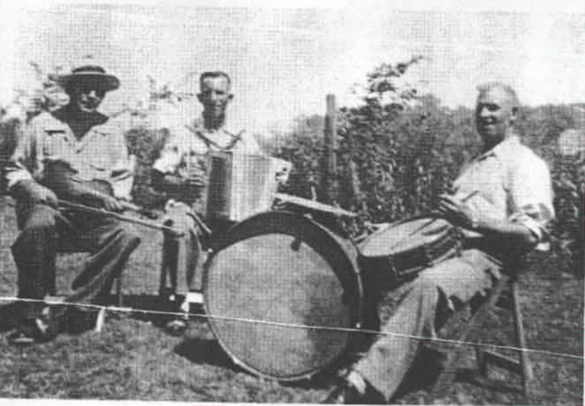
One of the first bands to play at Slovak picnics