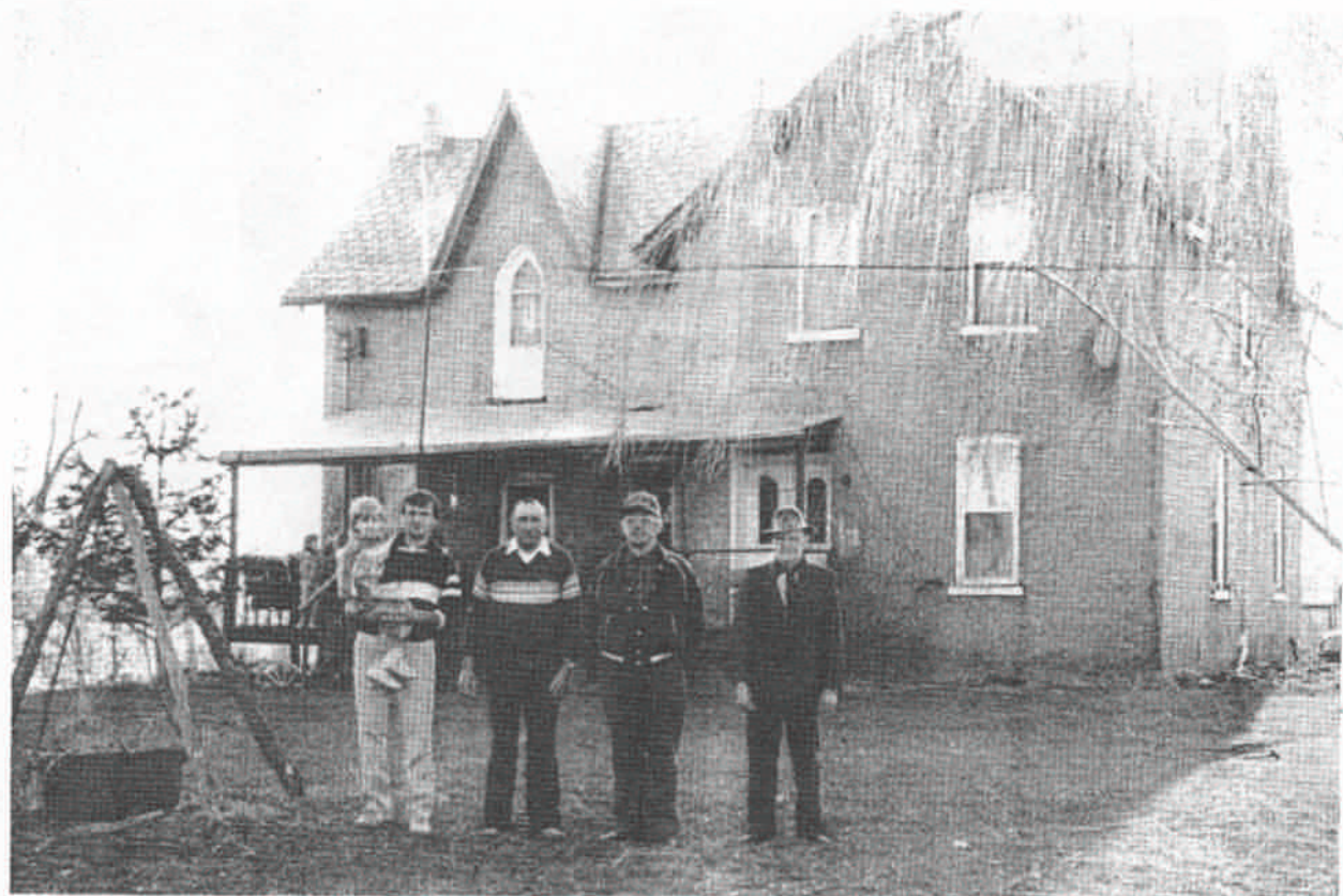
Four generations of the Lucan family