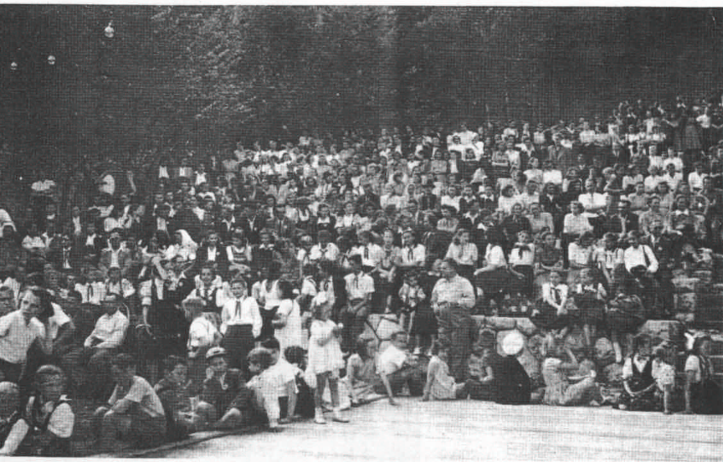
One of early Slovak picnics held in the bush 1939-40.