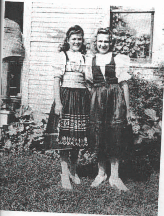
Former beauties — today they're both grandmothers