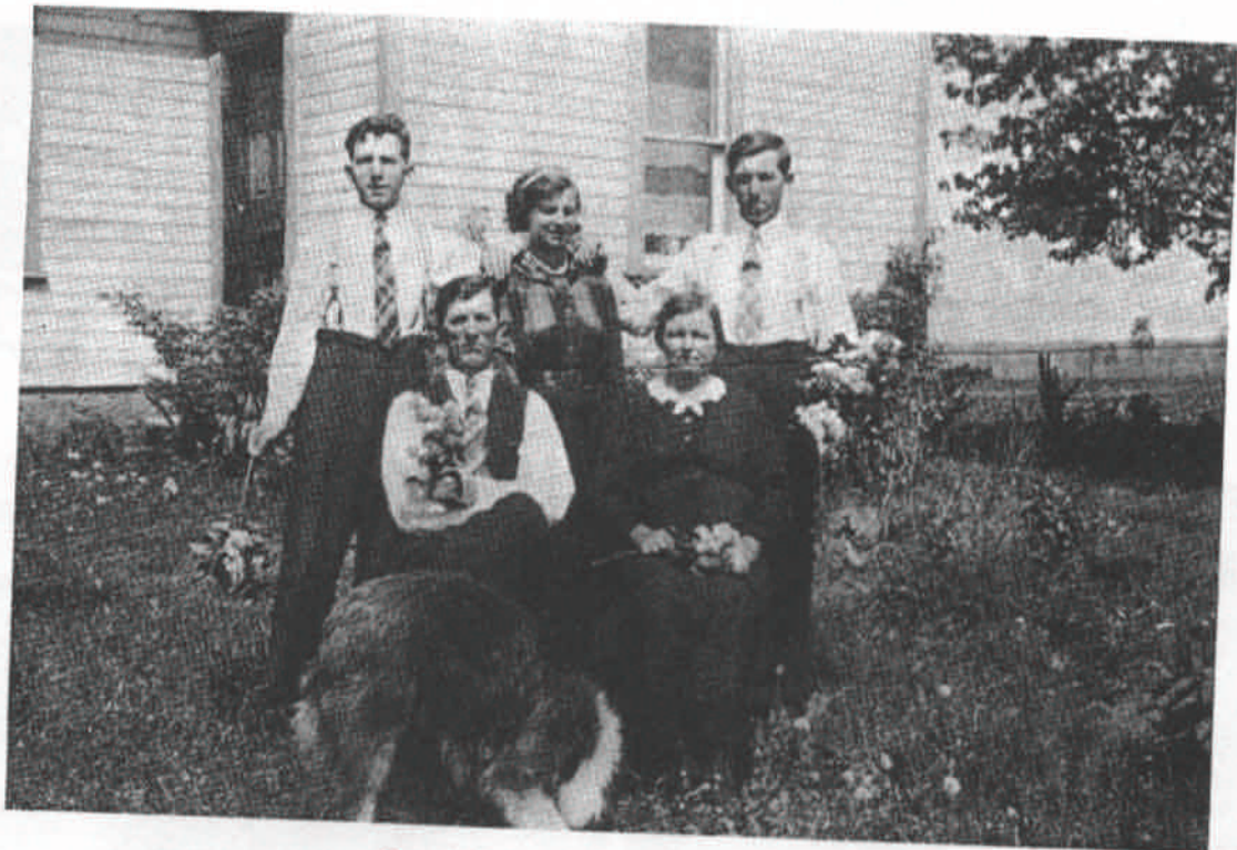
One of the first Slovak settlers near Inwood