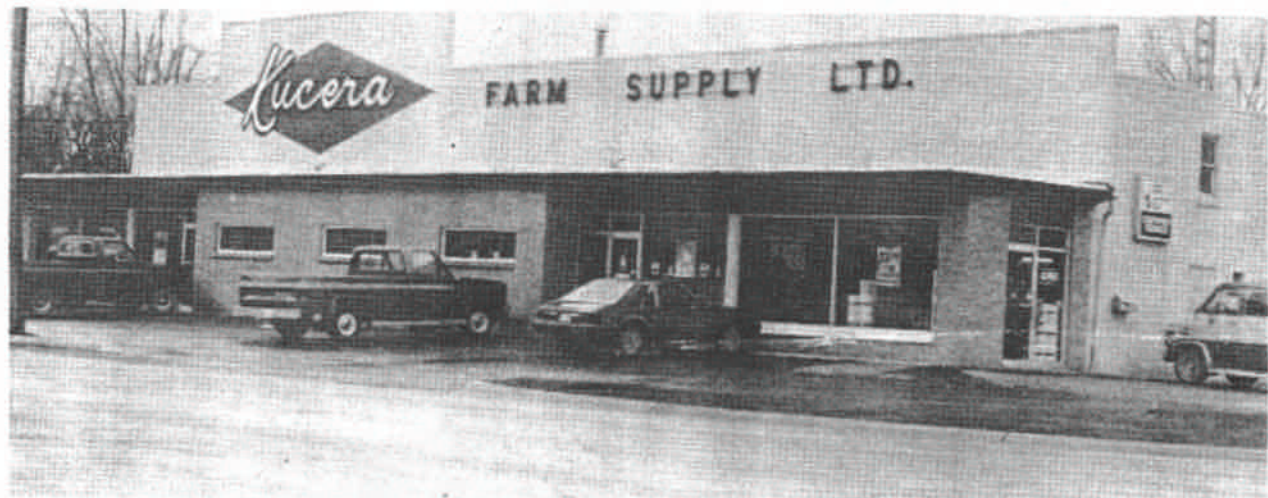
One of today's successful businesses operated by Slovak descendants.