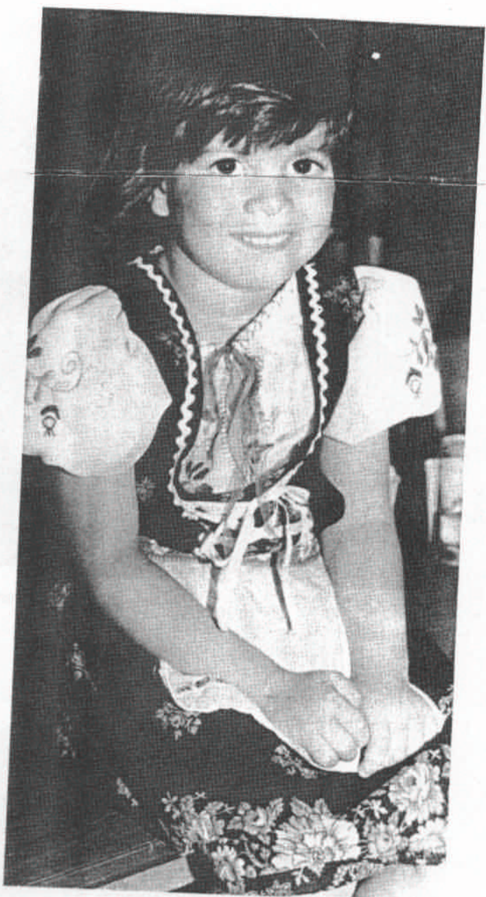
Present generation Slovak beauty