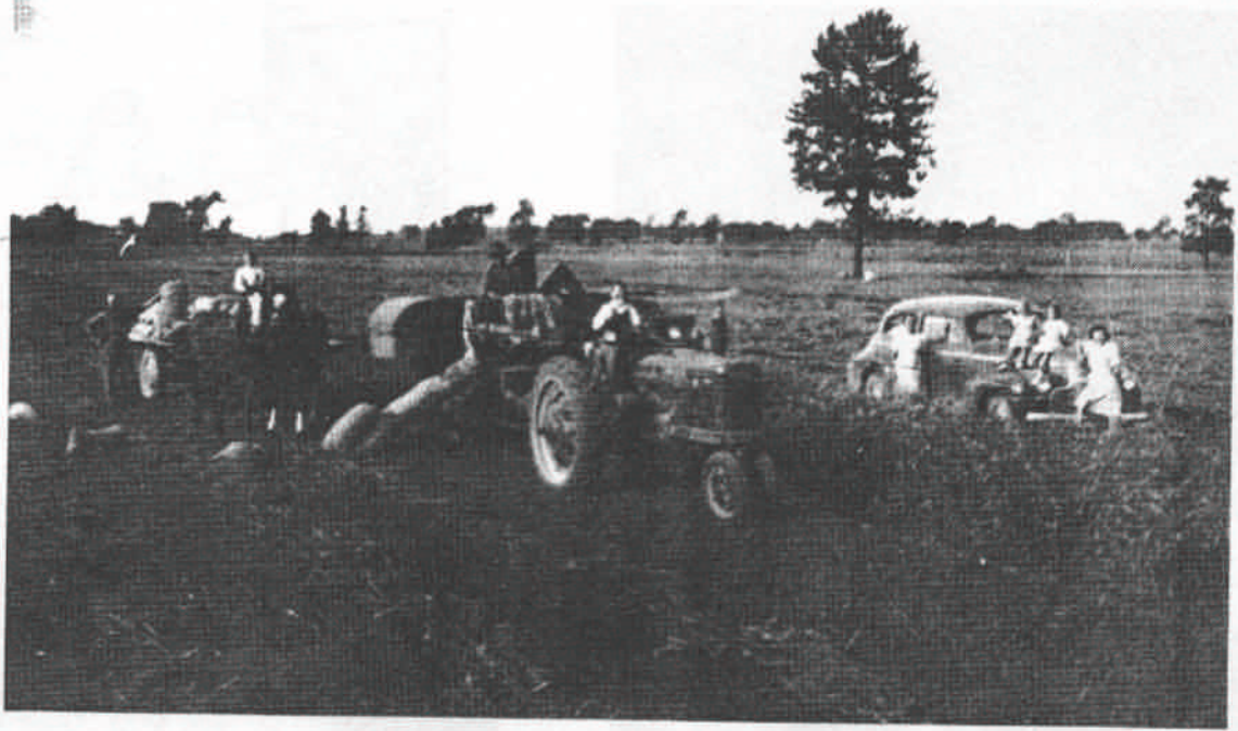
One of the first combines operated by a Slovak settler in the Alvinston-Inwood area, 1941