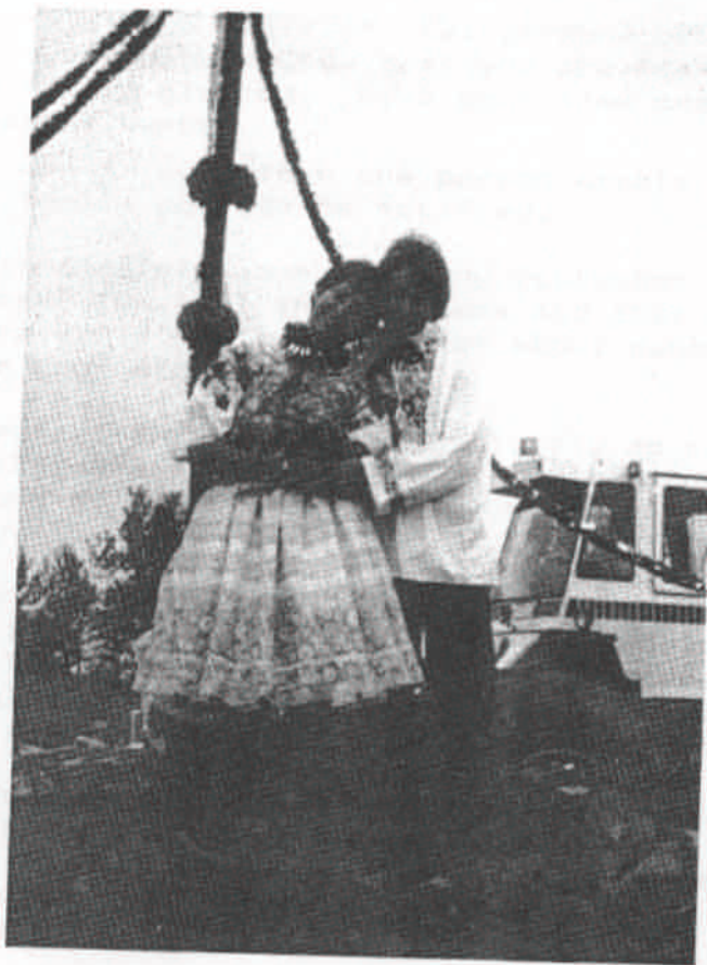
Helping to celebrate Alvinston's Centennial in 1980