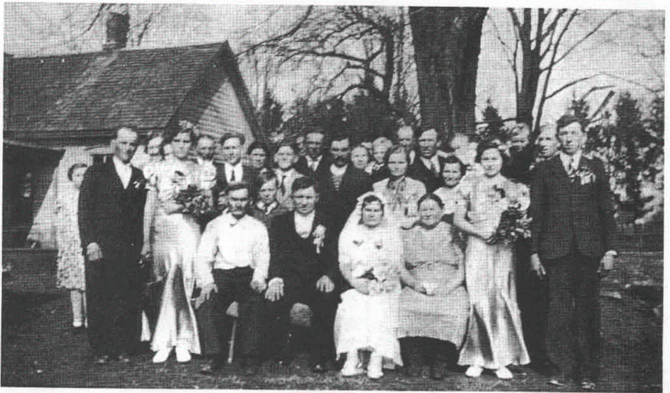
First Slovak wedding in Lambton in April 1938