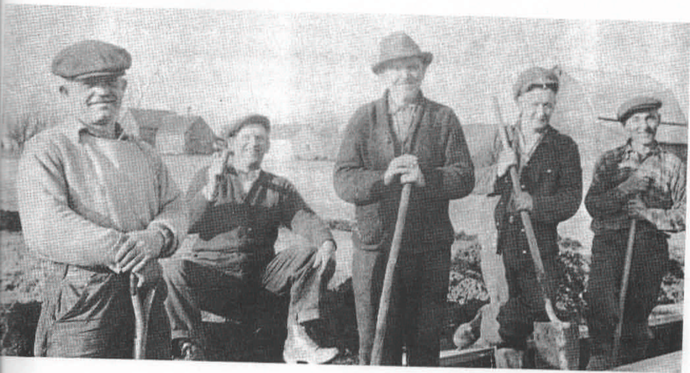
Digging foundations for the Slovak Hall at Alvinston.